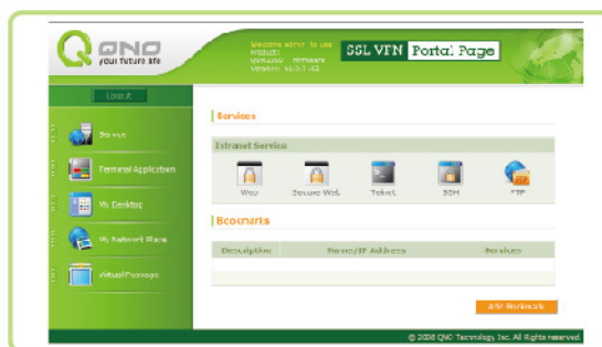
• Various Internet Services of SSL VPN

This device is an all-in-one SSL VPN offering maximum 100 SSL VPN tunnels. Firstly, it is effortless for users to finish the VPN connections which need only a web browser, User Name, and Password. Secondly, single sign-in allows users automatically log-in application servers without another import whenever the password is the same with SSL service. Thirdly, one-page set up allows you complete SSL VPN configurations in just one page by applying a sample, which is very plain for nonprofessionals. Fourthly, it provides various resources like Internet Service, File Sharing and Remote Desktop for users. As well considering of security issues, it has a virtual keyboard to prevent hacker invasion. After the SSL tunnel is terminated, vital records and information from web cache and cookie will be cleared in case of deceived.